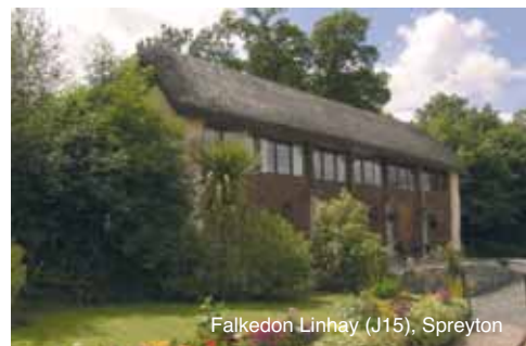
Falkedon Linhay (J15), Spreyton