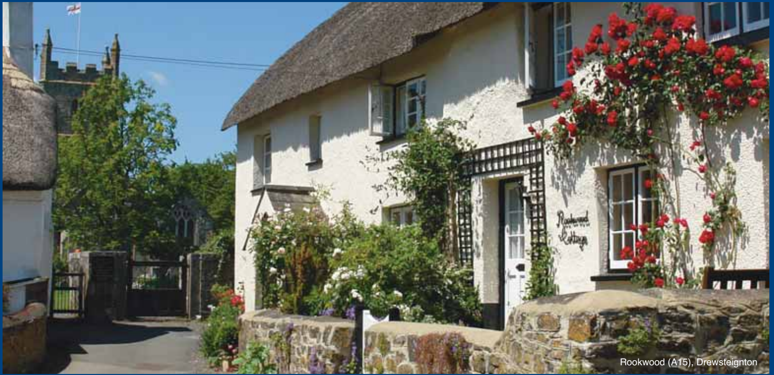
Rookwood (A15), Drewsteignton