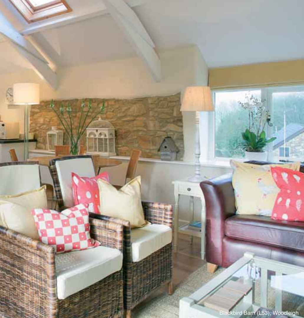
Blackbird Barn (L53), Woodleigh