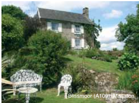
Blissmoor (A109), Manaton