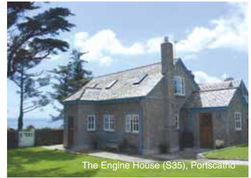
The Engine House (S35), Portscatho