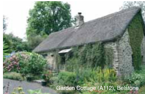
Garden Cottage (A112), Belstone