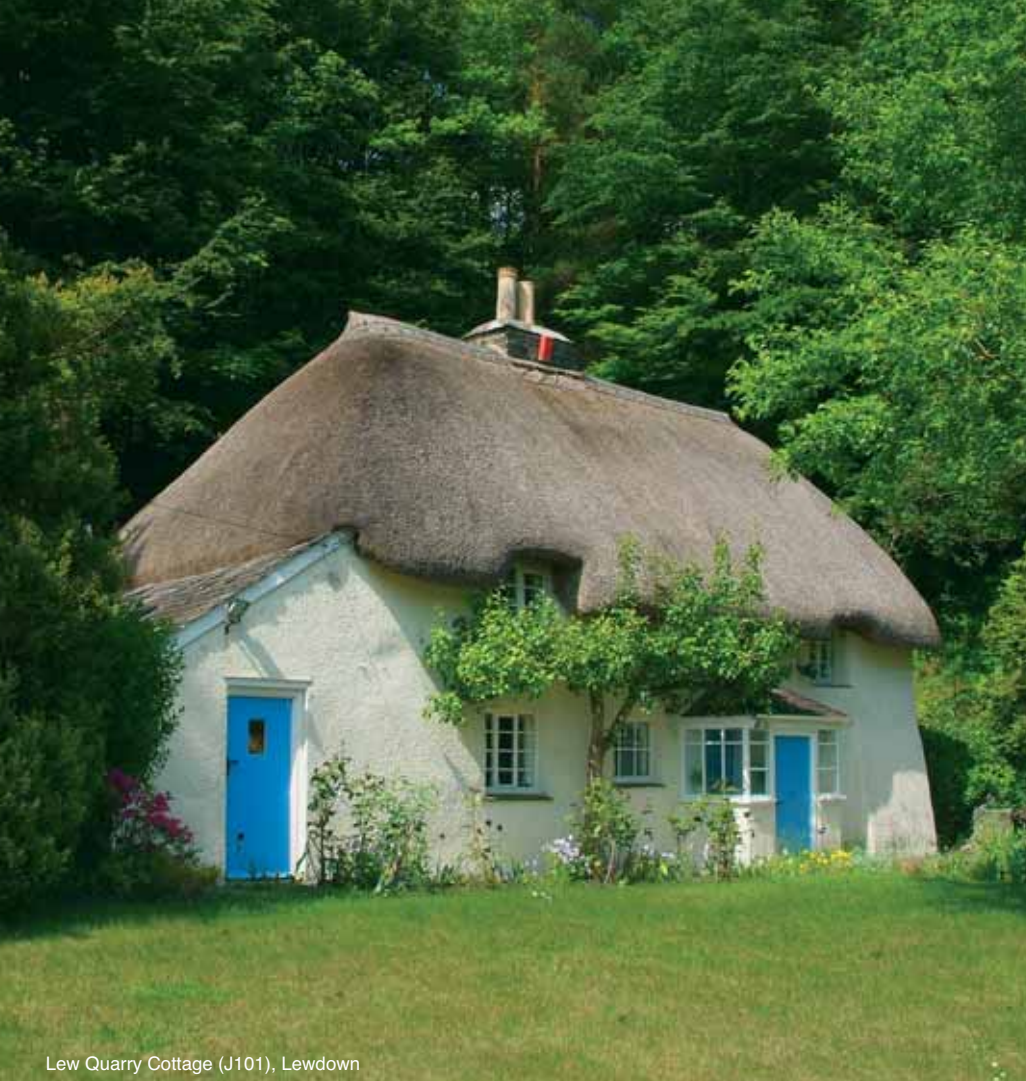
Lew Quarry Cottage (J101), Lewdown