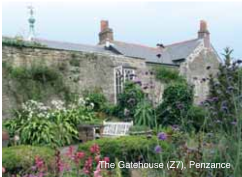
The Gatehouse (Z7), Penzance