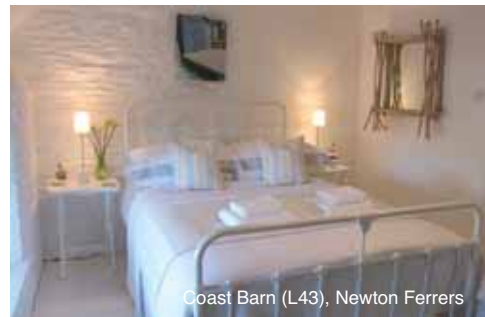
Coast Barn (L43), Newton Ferrers