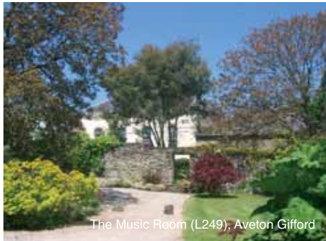
The Music Room (L249), Aveton Gifford