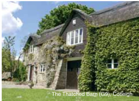
The Thatched Barn (G9), Cotleigh