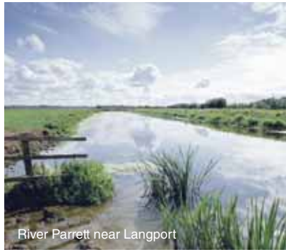
River Parrett near Langport