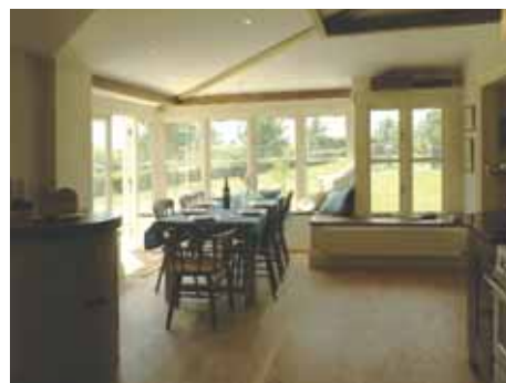
... and 2 miles from Ilminster , in the small hamlet of Hurcott , this attractive attached local stone-built cottage sits at the end of a row of three. Good-sized

gardens to the front and side (patio with table/chairs, barbecue), a gravelled courtyard and 1½ acres of cider apple orchard (picnic bench) to the rear: a lovely peaceful location with far-reaching countryside views . Inside, utility room ( washing machine, tumble drier , butler sink). Well-equipped fitted kitchen/dining room (attractive handmade distressed units, granite worktops, modern gas range with double ovens, dishwasher, microwave, fridge-freezer ) with wood floor and large dining table perfectly positioned in the window (window seats all round) for those great time-wasting views . From the kitchen, arch through to cosy living room with fine stone fireplace ( open fire ), TV/DVD. Downstairs twin bedroom (TV/DVD, doors to garden) and shower-room (suite, power-shower). Stairs up to two more bedrooms (both with long, rolling countryside views ) – a double (5' sleigh bed), and a single. Smart bathroom (suite plus hand-shower). Outside, a garage/store, now a games room and brick-built dog kennel and run. A peaceful retreat, comfortable, well-equipped and good quality throughout.