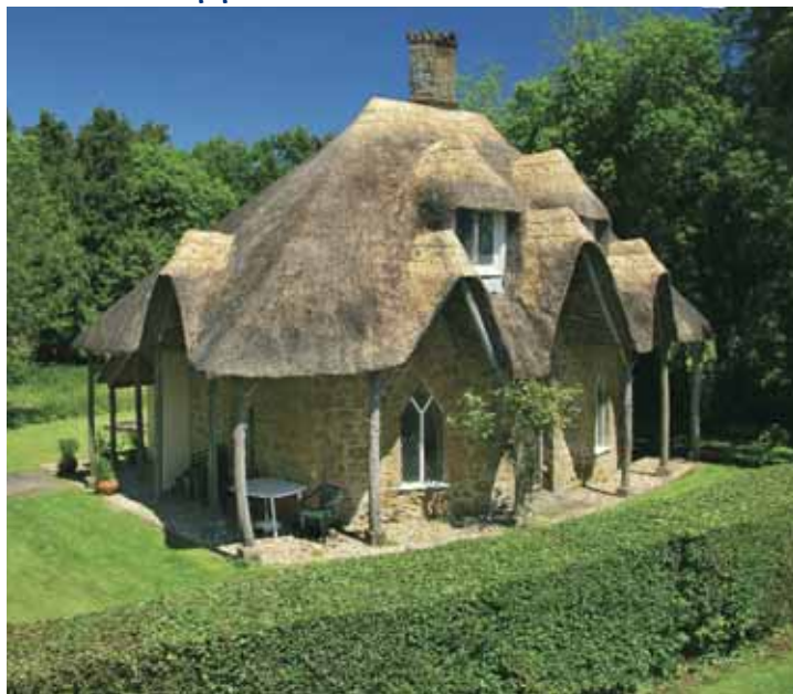
Ilminster (see page 16):

... about a mile outside Ilminster , within a great country estate of much history , is the Gingerbread House – thatched, hexagonal, Grade II listed . On the edge of woods, about 300 yards down a farm track, 100 yards from farm-buildings and approx. 300 yards from the busy A358 road (visible), it was built c1800 as a game-keeper's home and has been restored. You are welcome to walk the 500 acres of farmland (sheep), park and woodland by arrangement . Farm café within walking distance.